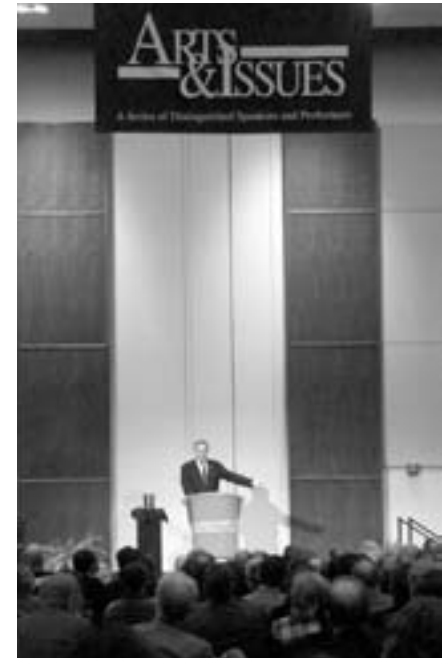
Steve Forbes, President and CEO of Forbes Inc. , and Editor-in-Chief of Forbes magazine , explores some of the most compelling global business issues of the day while speaking to a sold-out Arts & Issues audience.