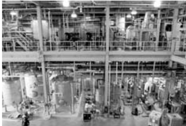
University Park is home to the National Corn-to-Ethanol Research Center, the only facility in the world that fully emulates both a wet- and dry-mill commercial fuel ethanol production center.