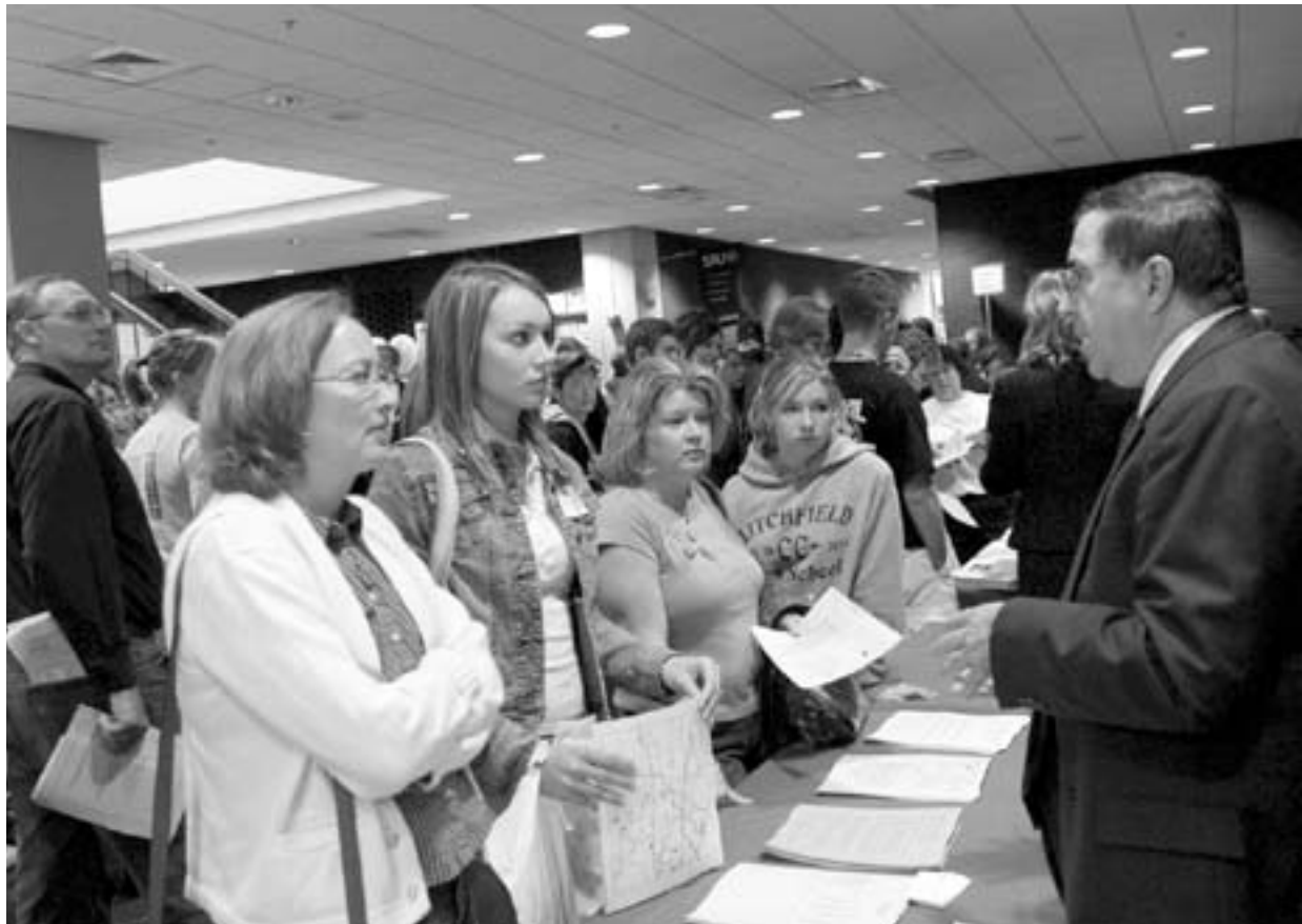
PREVIEW SIUE, an annual campus visit opportunity for prospective students and parents, attracts more than 3,200 visitors to the area each year.

Located on 2,660 rolling acres within the St. Louis Metropolitan Area, SIUE increasingly is the first choice of students wishing to pursue a college education. For nearly 50 years, SIUE has prepared students to become leaders in their community and professionals in their fields of study. More than 70,000 SIUE alumni demonstrate our values. More than 37,000 live in the study area and contribute to the economy.