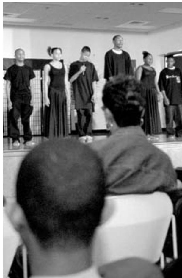
The SIUE East St. Louis Center provides comprehensive programs, services, and training to families and individuals in East St. Louis and surrounding urban communities. More than 8,000 people have benefited from East St. Louis Center services in the past year.

The annuitants’ survey was conducted between May 24, 2005, and August 29, 2005. Eighty usable survey responses were received (8.8 percent). Responses were weighted to reflect the size of the population.