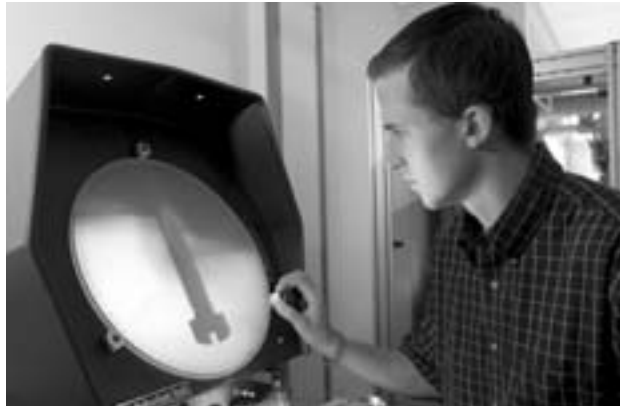
The Southwest Illinois Advanced Manufacturing (SIAM) Center is a collaborative effort between the SIUE School of Engineering and Lewis and Clark Community College, funded by the Department of Commerce Economic Development Administration. SIAM assists both established and start-up enterprises in St. Louis and Southwestern Illinois with automation, fabrication, measurement and control activities.